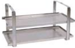
Rack & Shelves (RS)

All Tuttnauer loading equipment is manufactured from high quality stainless steel material. We offer several different options in order to accommodate our various model lines. Please reference the chart below to determine which piece of loading equipment is available for each chamber size. Special designs can be provided upon request.