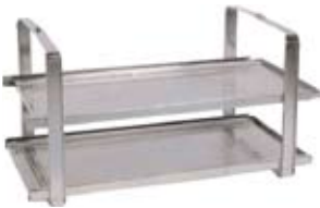
Rack & Shelves