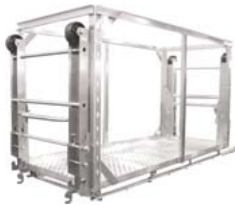
Drop Wheel Loading Cart