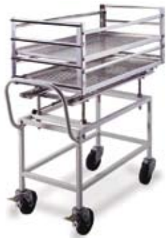
Loading Cart & Transfer Carriage