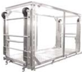
Drop Wheel Loading Cart (DWLC)