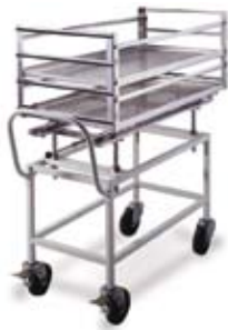
Loading Cart & Transfer Carriage (LC/TC)