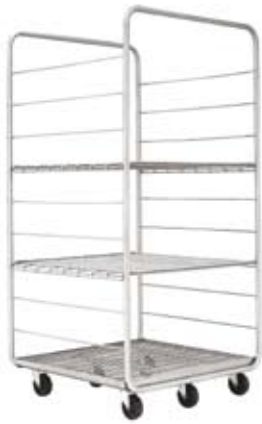
Floor Loading Cart