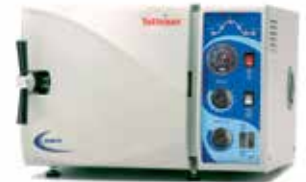
Manual Table-Top Autoclaves

Tuttnauer USA Co. 25 Power Drive, Hauppauge, NY 11788 Tel: +800 624 5836, +631 737 4850 Fax: +631 737 1034 E-mail: info@tuttnauerUSA.com www.tuttnauerUSA.com