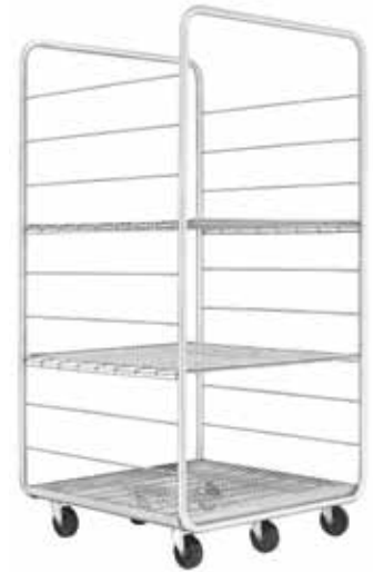
■ Floor Loading Cart

Contact a Tuttnauer representative to help you determine what generator type best fits your needs.