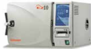
Fully Automatic Table-Top Autoclaves