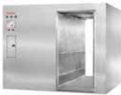
Large Capacity Sterilizers for Medical Use

Featuring Tuttnauer's range of cleaning, disinfection and sterilization solutions