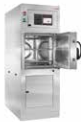
Horizontal Steam Sterilizers for Laboratory & Scientific Applications